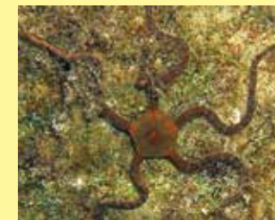
14/A - smooth brittlestar