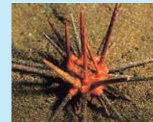
15/A - red lance urchin