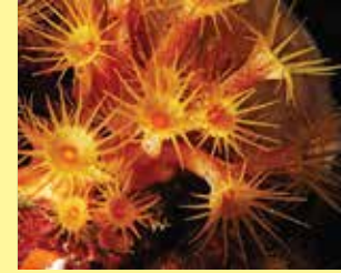
4/B - yellow cluster anemone