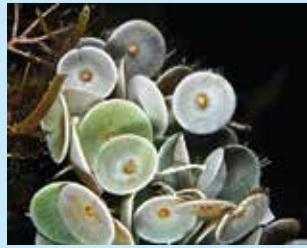
1/A - mermaid's wine glass