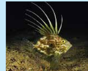
17/D - John Dory