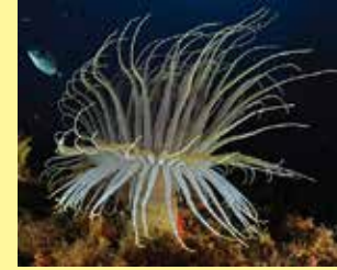
4/C - cylinder anemone