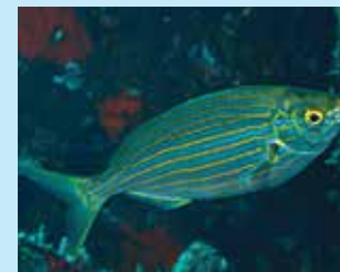
17/L - salema