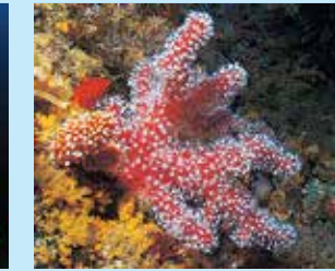
3/C - red dead men's fingers