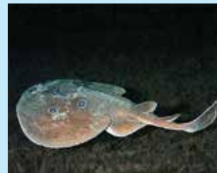
17/A - common torpedo