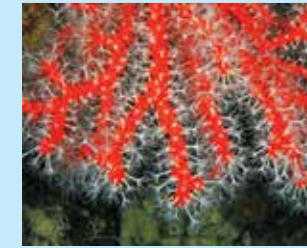
3/A - precious red coral