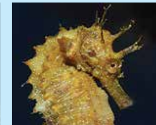
17/E - long-snouted branched seahorse