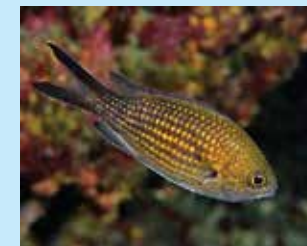
17/M - damselfish