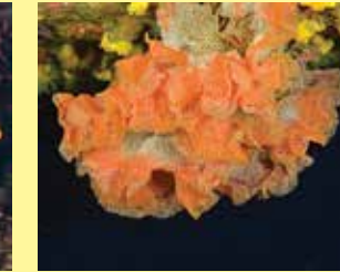
10/B - sea lace