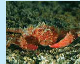
9/C - spider crab