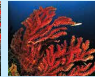
3/B - violescent sea-whip