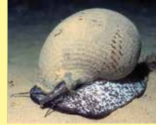
6/A - giant tun