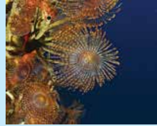
5/A - Mediterranean fanworm