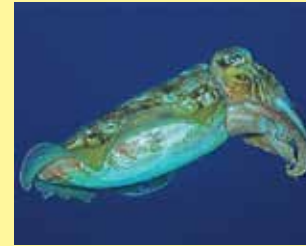
8/B - cuttle fish