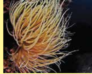
4/A - snakelocks anemone