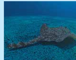
17/B - thornback ray