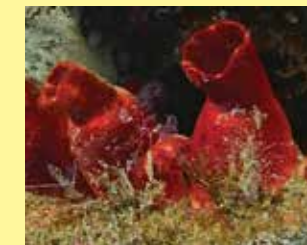
16/A - red sea-squirt