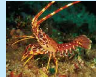
9/B - common spiny lobster