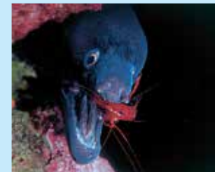
17/C - moray eel