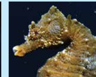
17/F - short-snouted seahorse