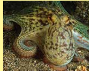
8/A - common octopus