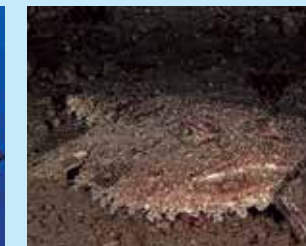
17/O - anglerfish