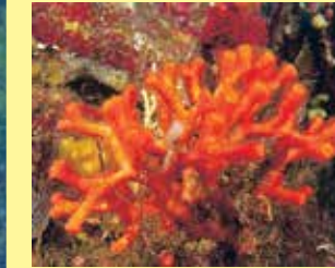
10/A - false coral