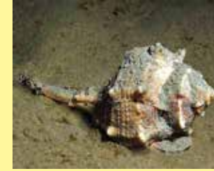
6/B - purple dye murex