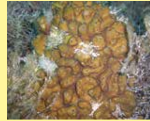
2/A - chicken liver sponge