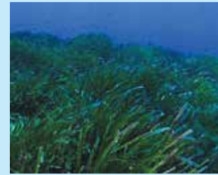
1/C - Neptune grass