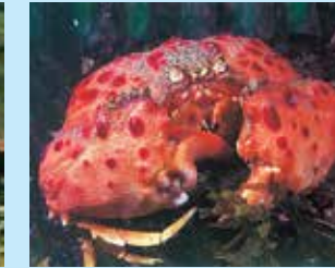
9/D - box crab