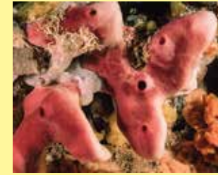
2/B - stony sponge