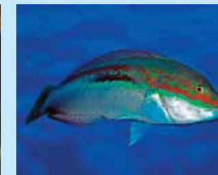
17/N - rainbow wrasse