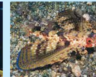
17/G - flying gurnard