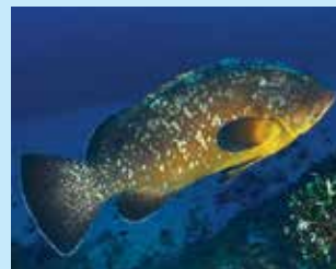
17/H - dusky grouper