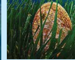
7/A - fan shell