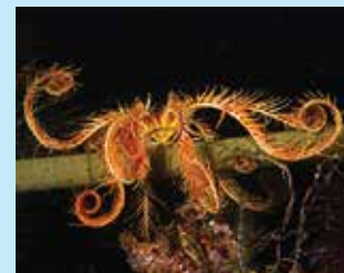
11/A - feather star