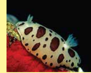
6/C - dotted sea slug