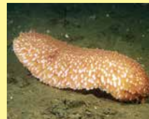
12/A - royal cucumber