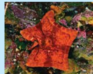
13/A - pentagon sea star