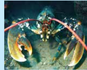
9/A - European lobster