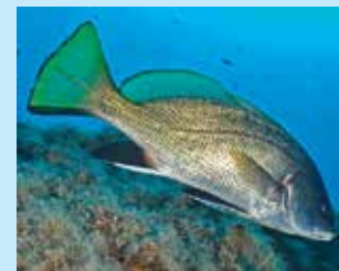
17/I - sea raven